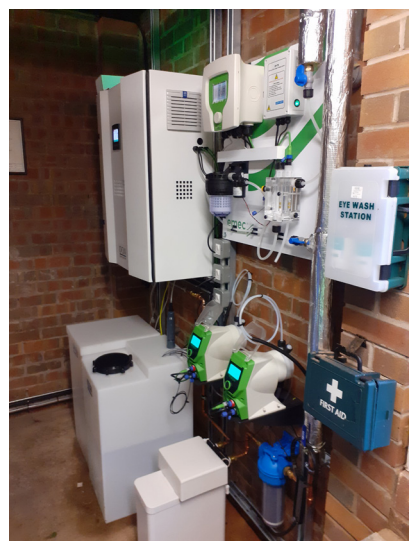
T15-30 LC Genox unit with brine tank and Neuthrox tank. Micro water softener and carbon filter. Two Prisma dosing pumps and Centurio chlorine monitor.