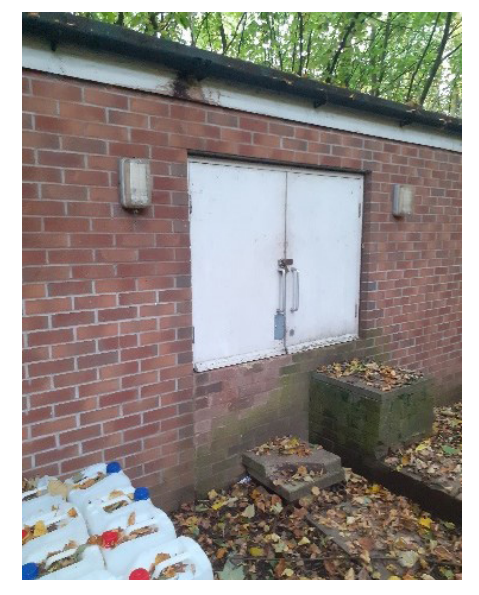
Before the installation of the Genox unit.