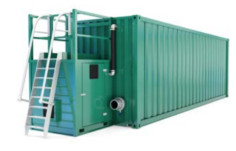
Hybrid-SAF™ T1KP vessel - click for link