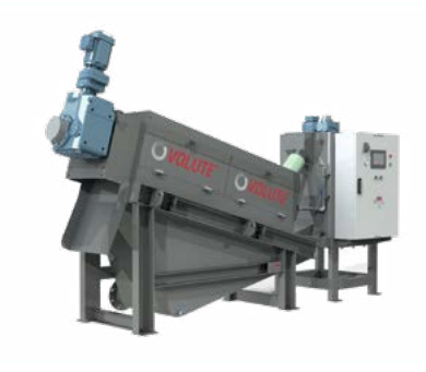
Volute<sup>™</sup> screw press - dewatering Containerised option available - click for link