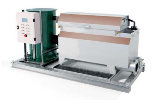
Microscreen - click for link