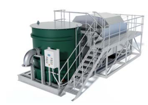
Disc filter - click for link