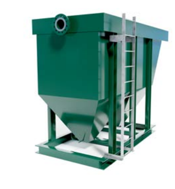
<u>Lamella separator - click for link</u>