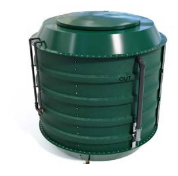
Hybrid-SAF™ T3HP vessel - click for link