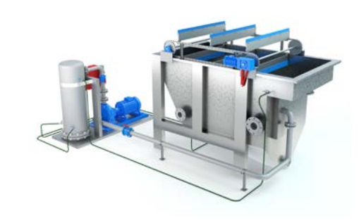
<u>Dissolved air flotation (DAF)</u> <u>Containerised option available - click for link</u>