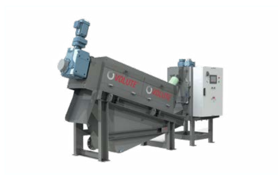
Volute<sup>™</sup> screw press - dewatering Containerised option available - click for link