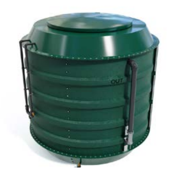
WCSEE Hybrid™ T3HP vessel - click for link