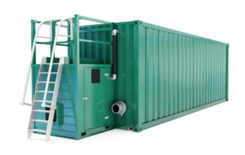
WCSEE Hybrid™ T1KP vessel – click for link