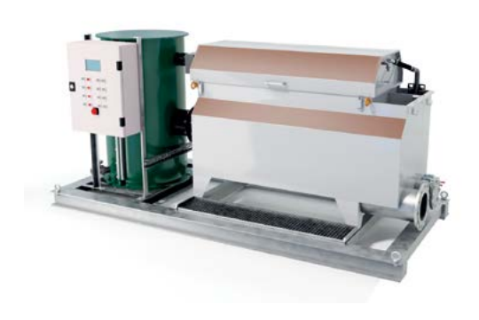
Microscreen - click for link