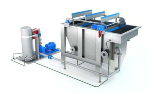
<u>Dissolved air flotation (DAF)</u> <u>Containerised option available - click for link</u>